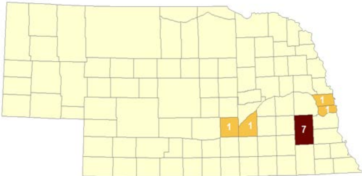
Board Distribution (2012-2013)